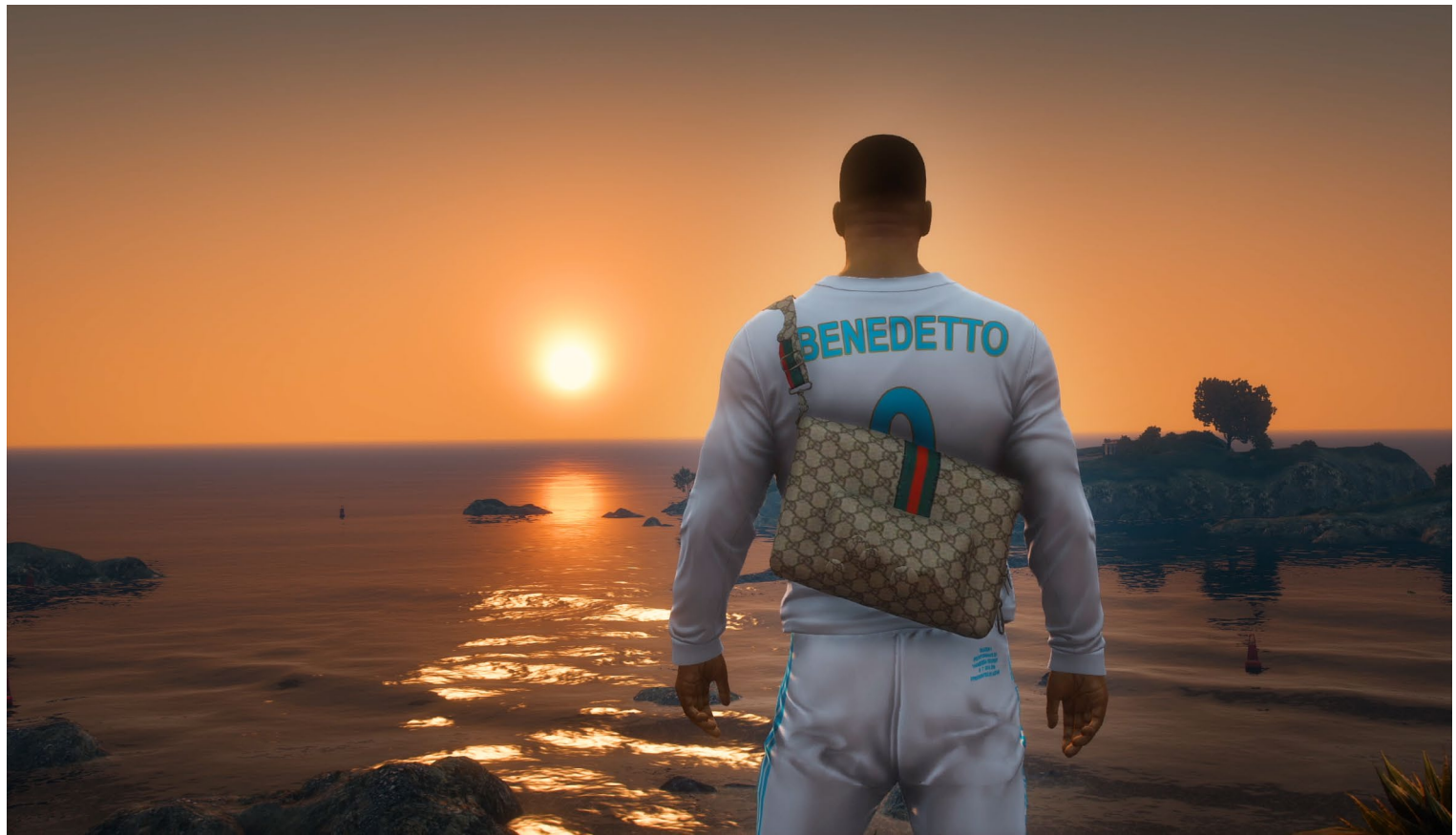
Sara Sadik, Khtobtogone , 2021, video, 16 minutes 9 seconds, commissioned by Cnap. Courtesy of the artist and Crève-cœur, Paris.