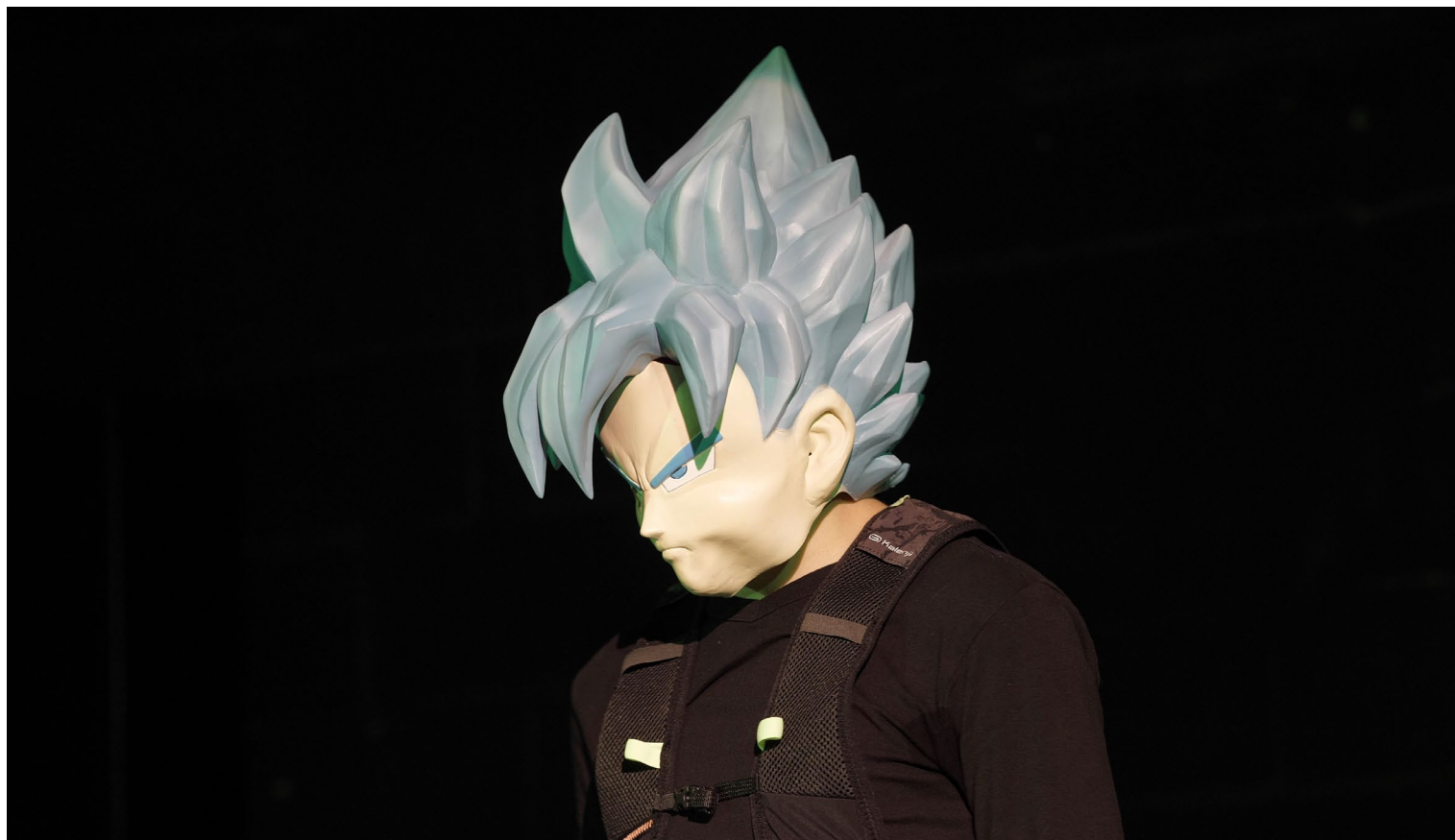
Tu deuh la miss , 2020, performance, 30 minutes, Friche la Belle de Mai, Marseille, as part of Festival Parallèle.