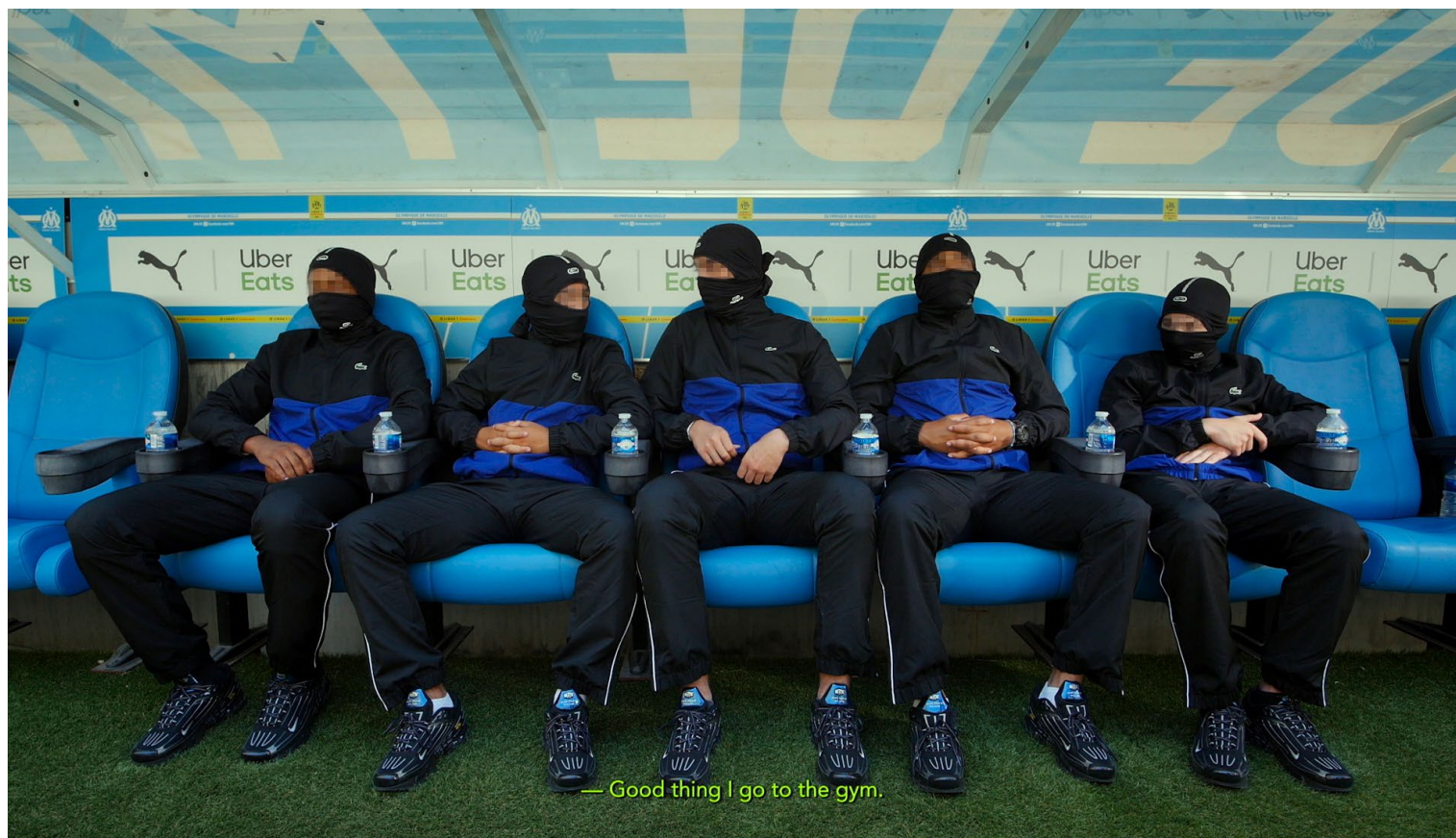
Sara Sadik, Carnalito Full Option , 2020, video, 20 minutes, commissioned by Manifesta 13 Marseille—The European Nomadic Biennial (Marseille, 2020), with the support of LAB360 et and Drosos Foundation.