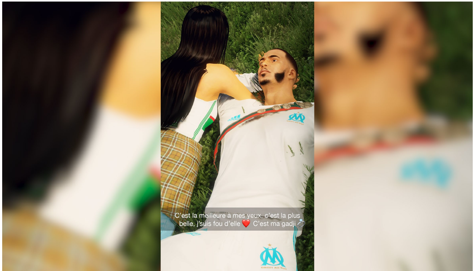
Sara Sadik, Khtobtogone , 2021, video, 16 minutes 9 seconds, commissioned by Cnap.