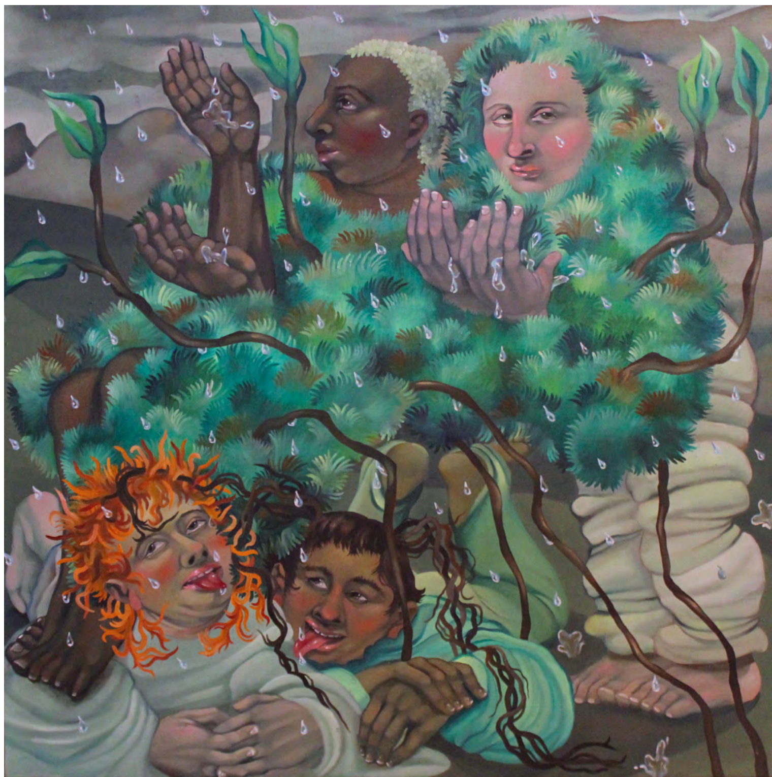
Camille Bernard, Nest (Shelter) , oil on canvas, 120x120 cm, 2021.