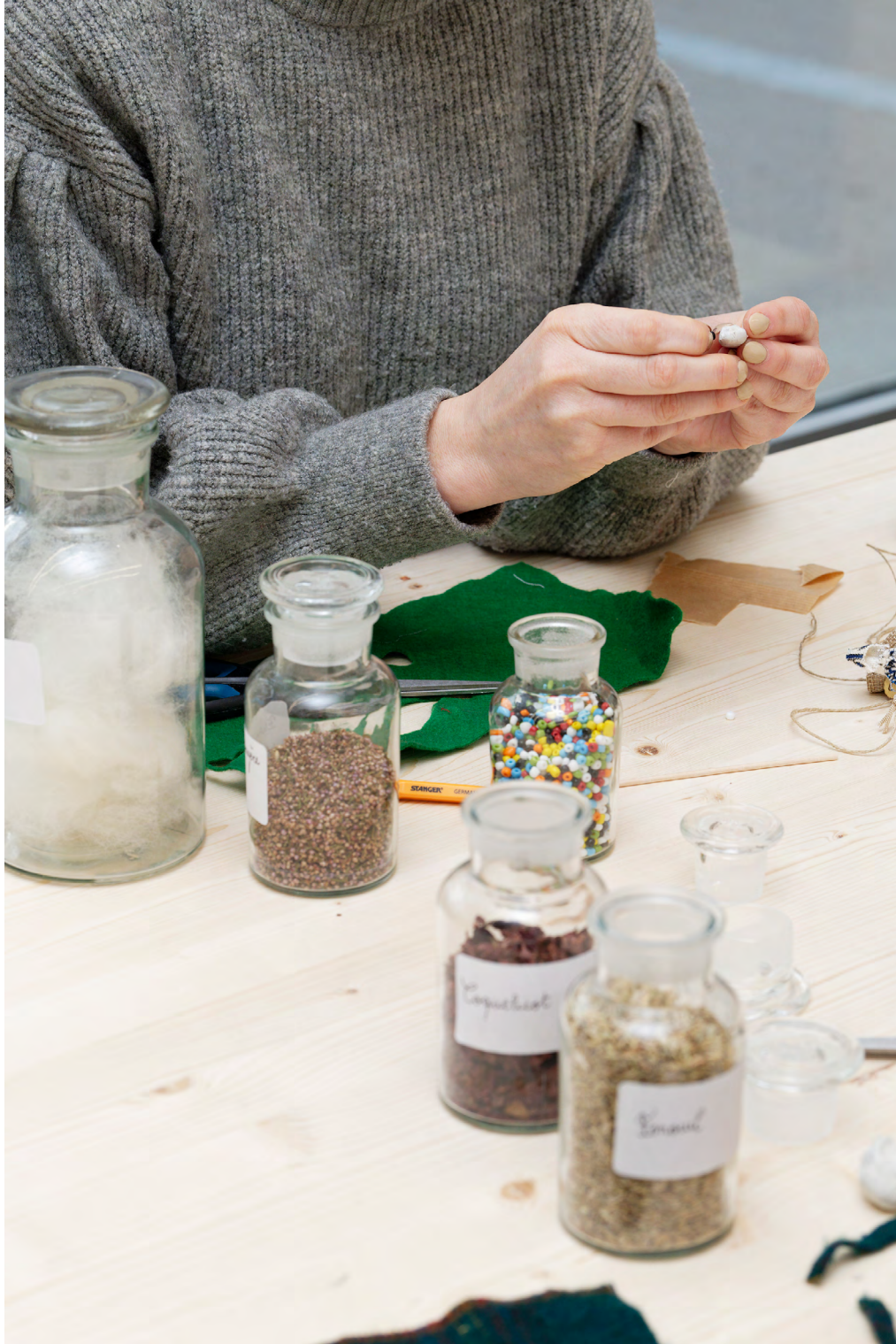
Space dedicated to free practice by l'École. Exhibition view of "Crazy Toads", Carlotta Bailly-Borg and Cécile Bouffard with l'École. Curator: Céline Poulin. CAC Brétigny, 2023.