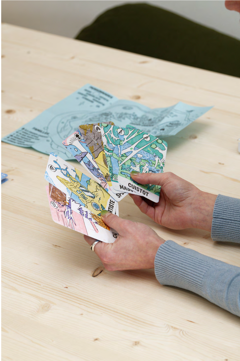
Space dedicated to free practice by l'École. Line Hachem and Raphaël Serres, Chaud Bouillon , 2022. Exhibition view of "Crazy Toads", Carlotta Bailly-Borg and Cécile Bouffard with l'École. Curator: Céline Poulin. CAC Brétigny, 2023.