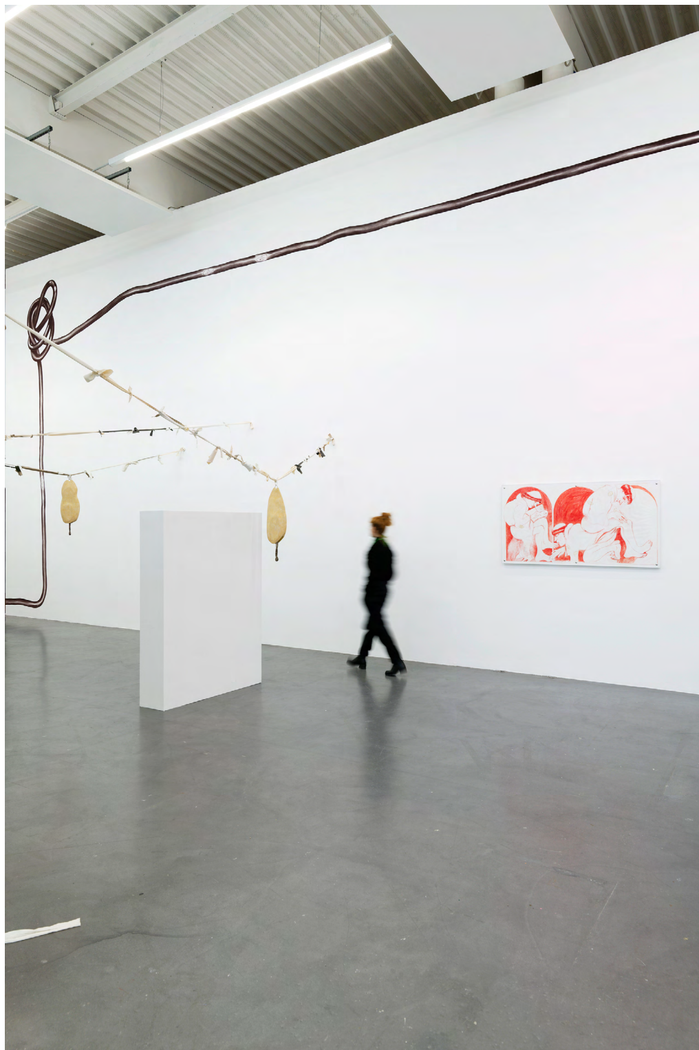
Exhibition view of "Crazy Toads", Carlotta Bailly-Borg and Cécile Bouffard with l'École. Curator: Céline Poulin. CAC Brétigny, 2023.