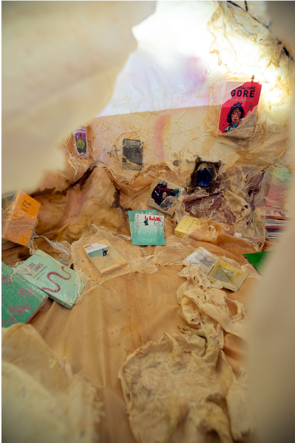
Rose-Mahé Cabel, Detail of Weaving mutation , 2023. View of the exhibition "Toutes a la fois mutantex et multiples", HEAR, 2023.