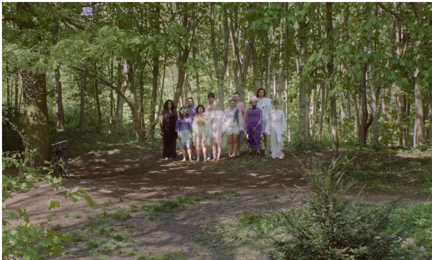
Aliha Thalien, L'Amour , 2021.