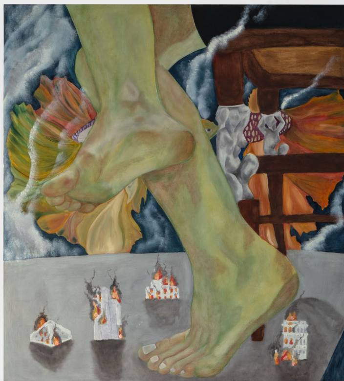
Giorgia Garzilli, Atlantide , 2020.