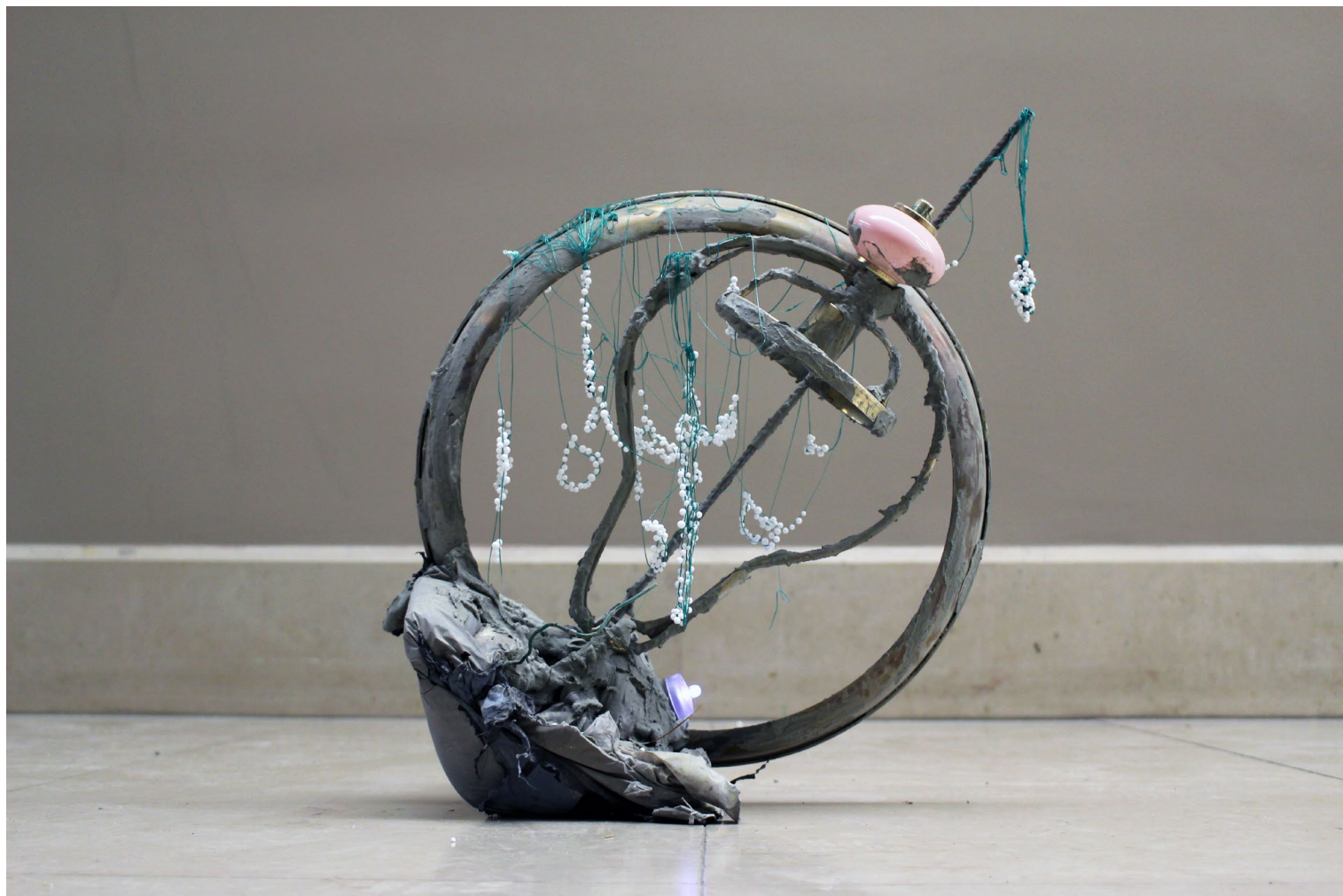
Pierre-Alexandre Savriacouty, R-3L , 2022.