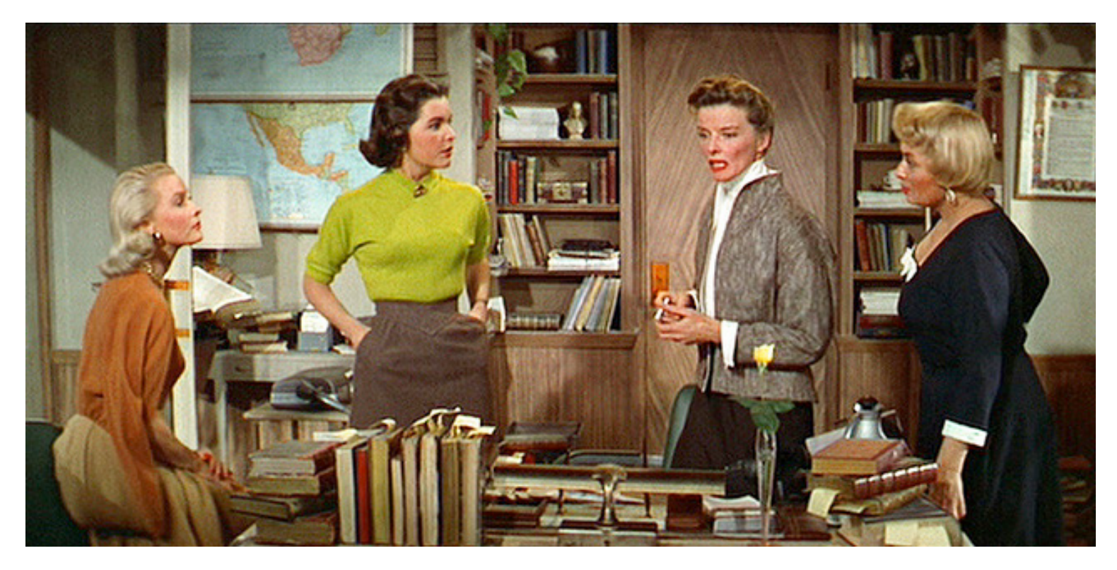
Walter Lang, Desk Set, 1957, film still. D.R.