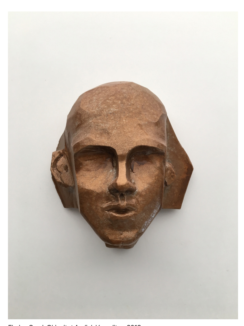
Florian Sumi, Chiquitet Arelich Vomalites , 2018. Natural clay, bearing bushing, 9 × 7,5 × 6 cm. Courtesy the artist and Galerie Escougnou-Cetraro, Paris.