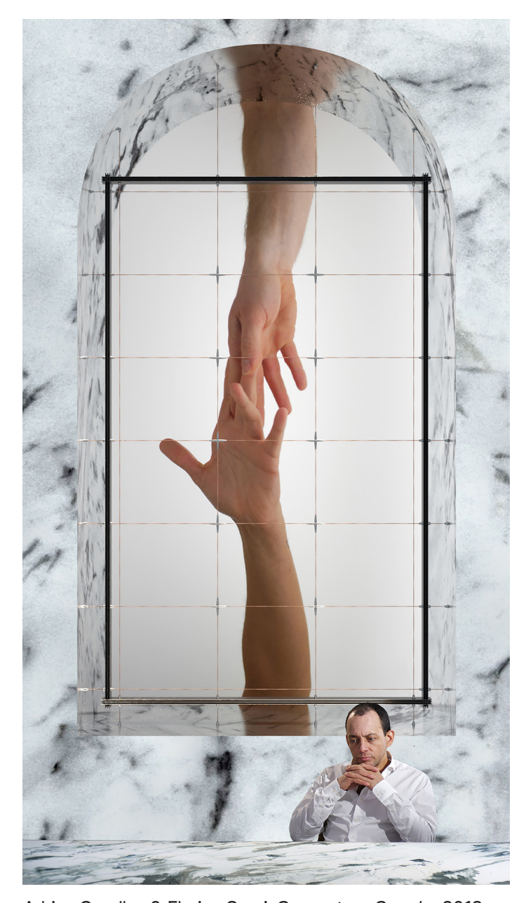
Adrien Cruellas & Florian Sumi, Computers, Spooky, 2018. Film (HD, 9'). Courtesy the artist and Galerie Escougnou-Cetraro, Paris.