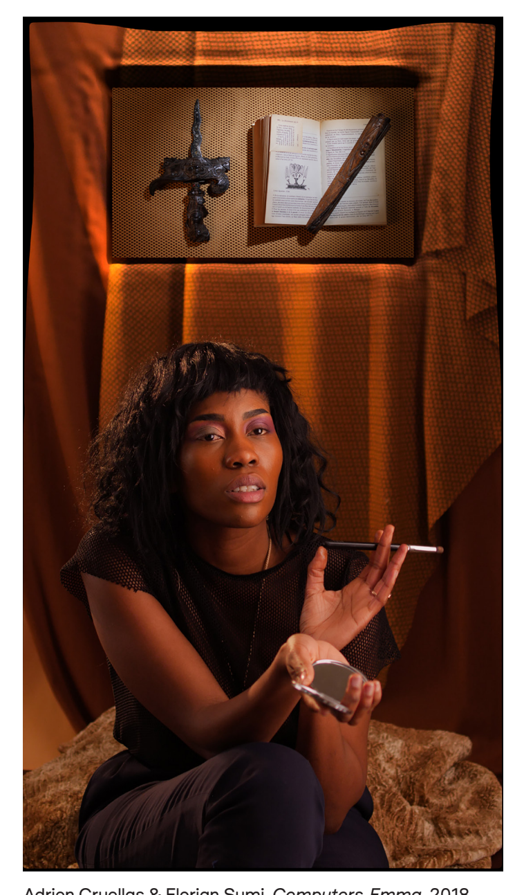
Adrien Cruellas & Florian Sumi, Computers, Emma , 2018. Film (HD, 14').