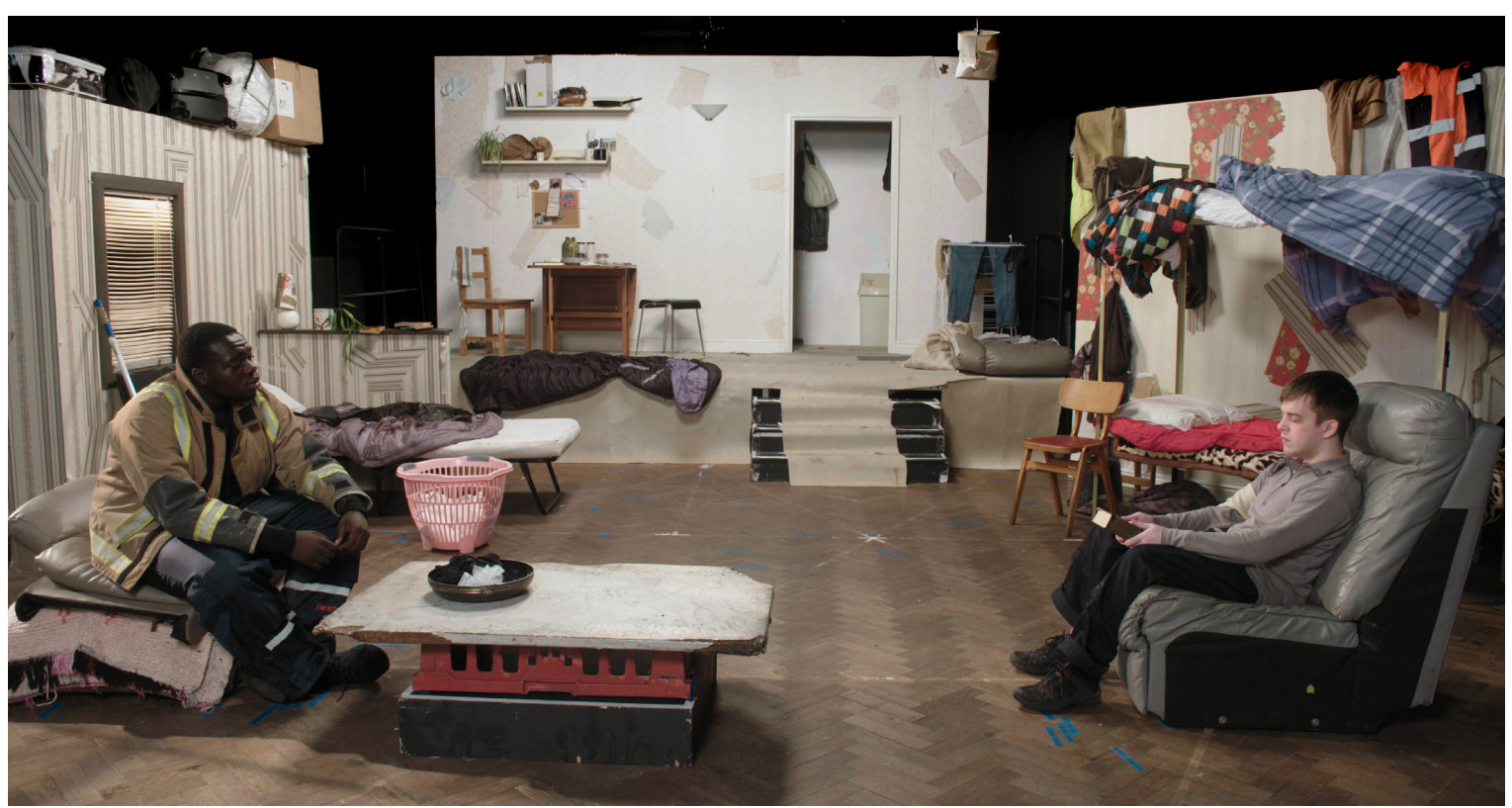
Still from Acorn , a filmed play by Switchers, 40 min, 4K video, 2021.