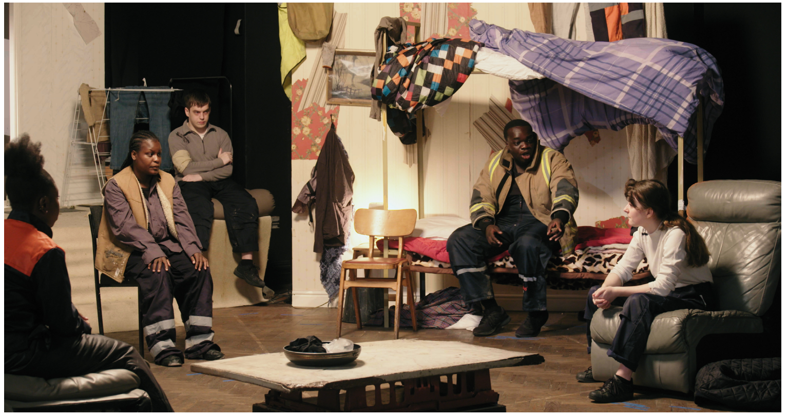
Still from Acorn , a filmed play by Switchers, 40 min, 4K video, 2021.