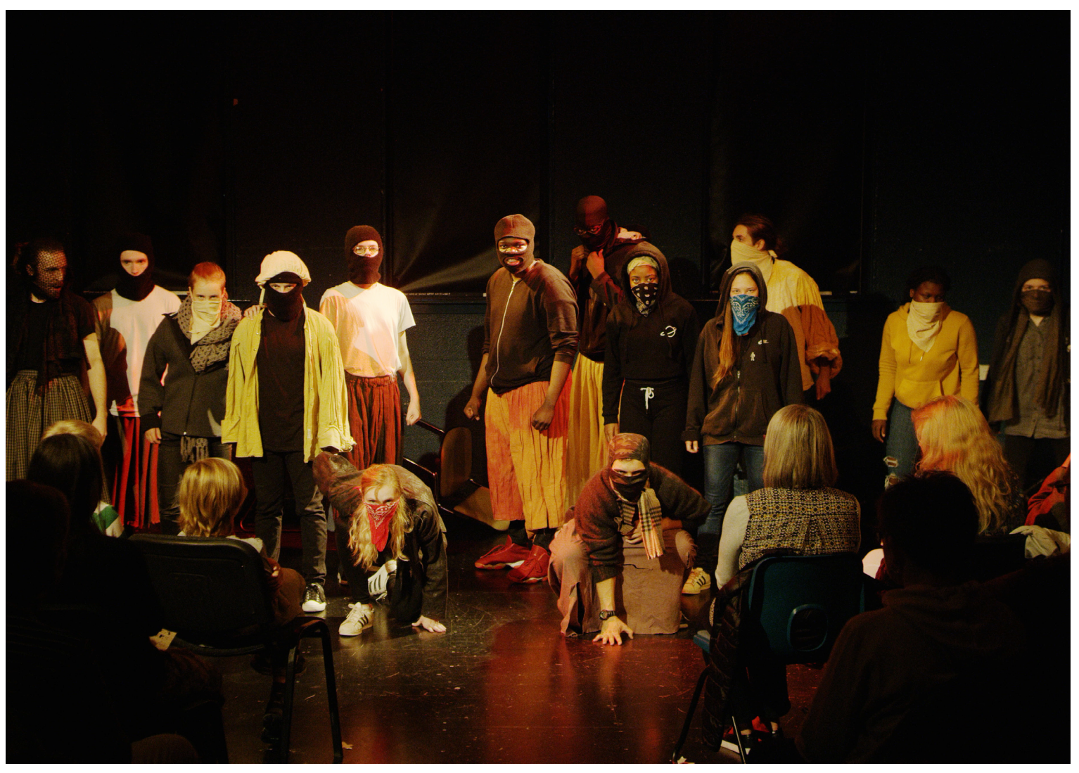
Still from The Nth Degree , Emanuel Almborg, 51min, HD video, 2018.